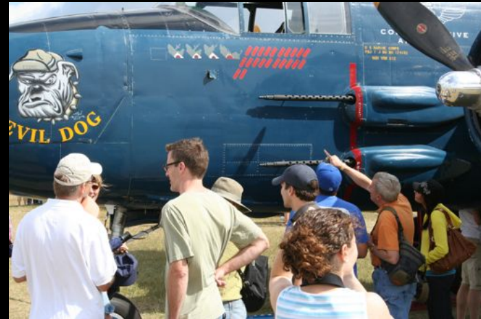
Tours and Airshows